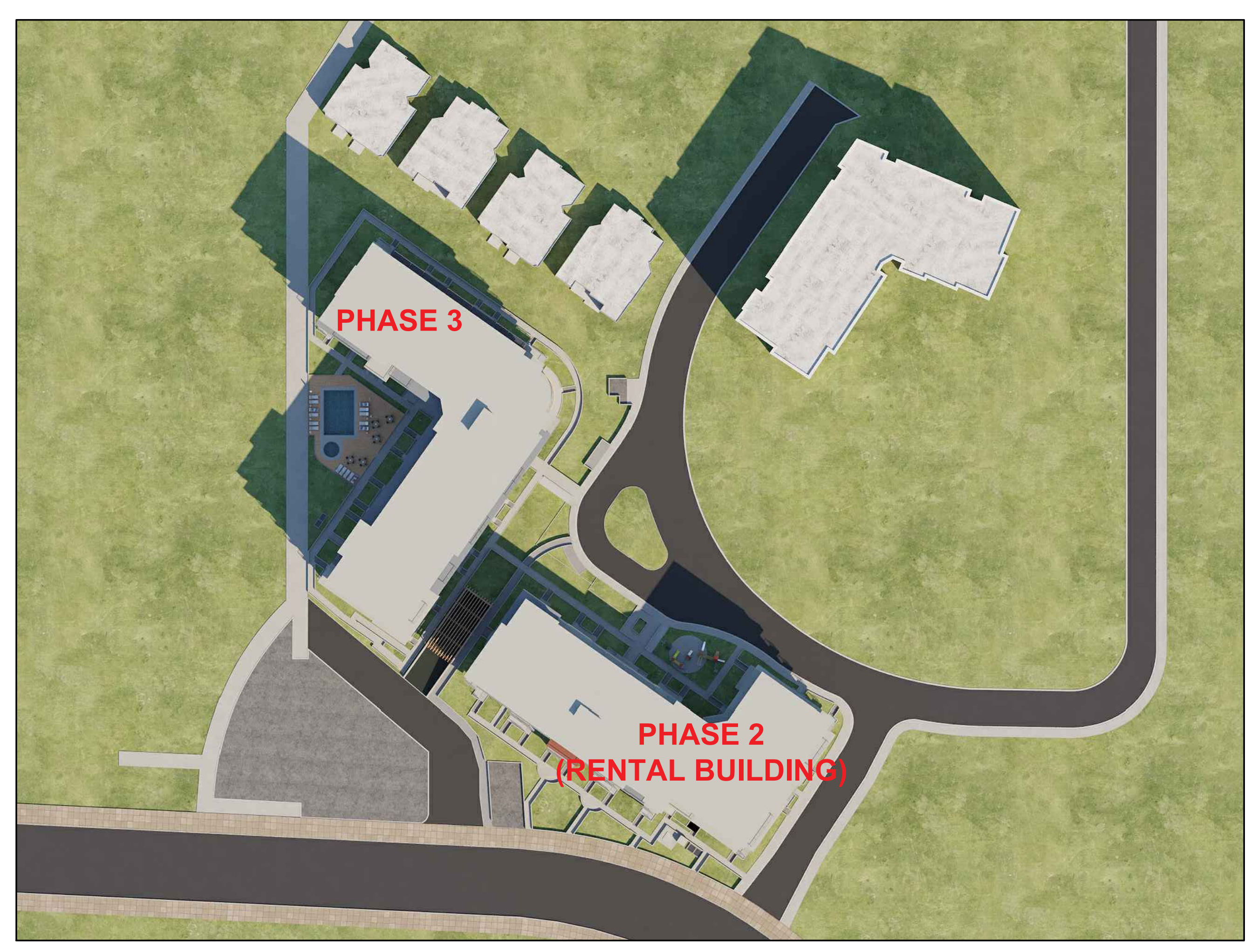
SEPTEMBER 22nd 10:00 AM