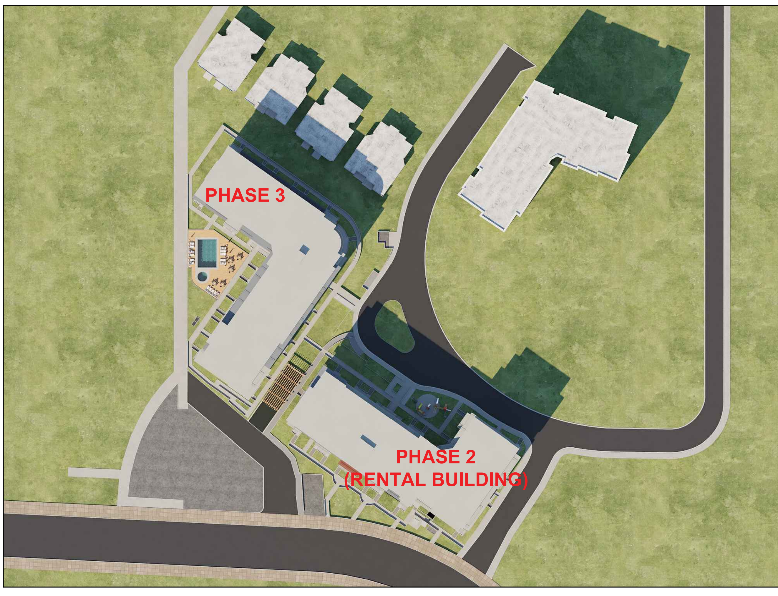
SEPTEMBER 22nd 2:00 PM