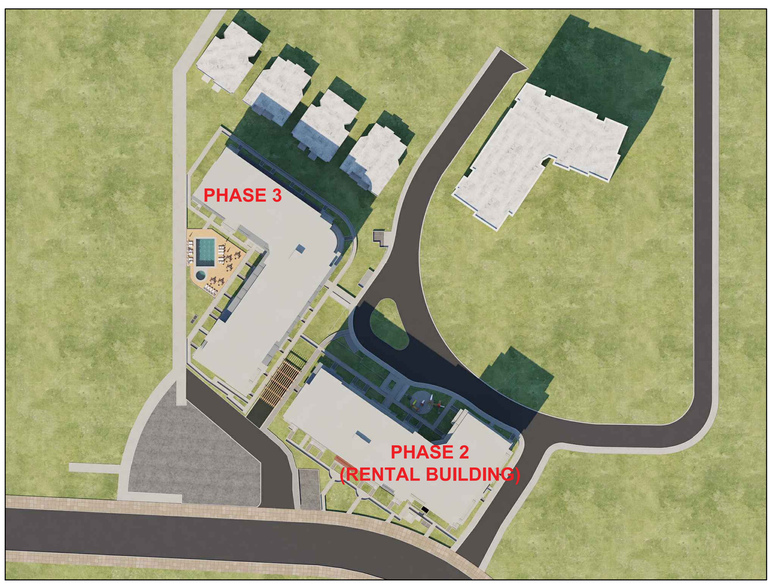
MARCH 22nd 2:00 PM