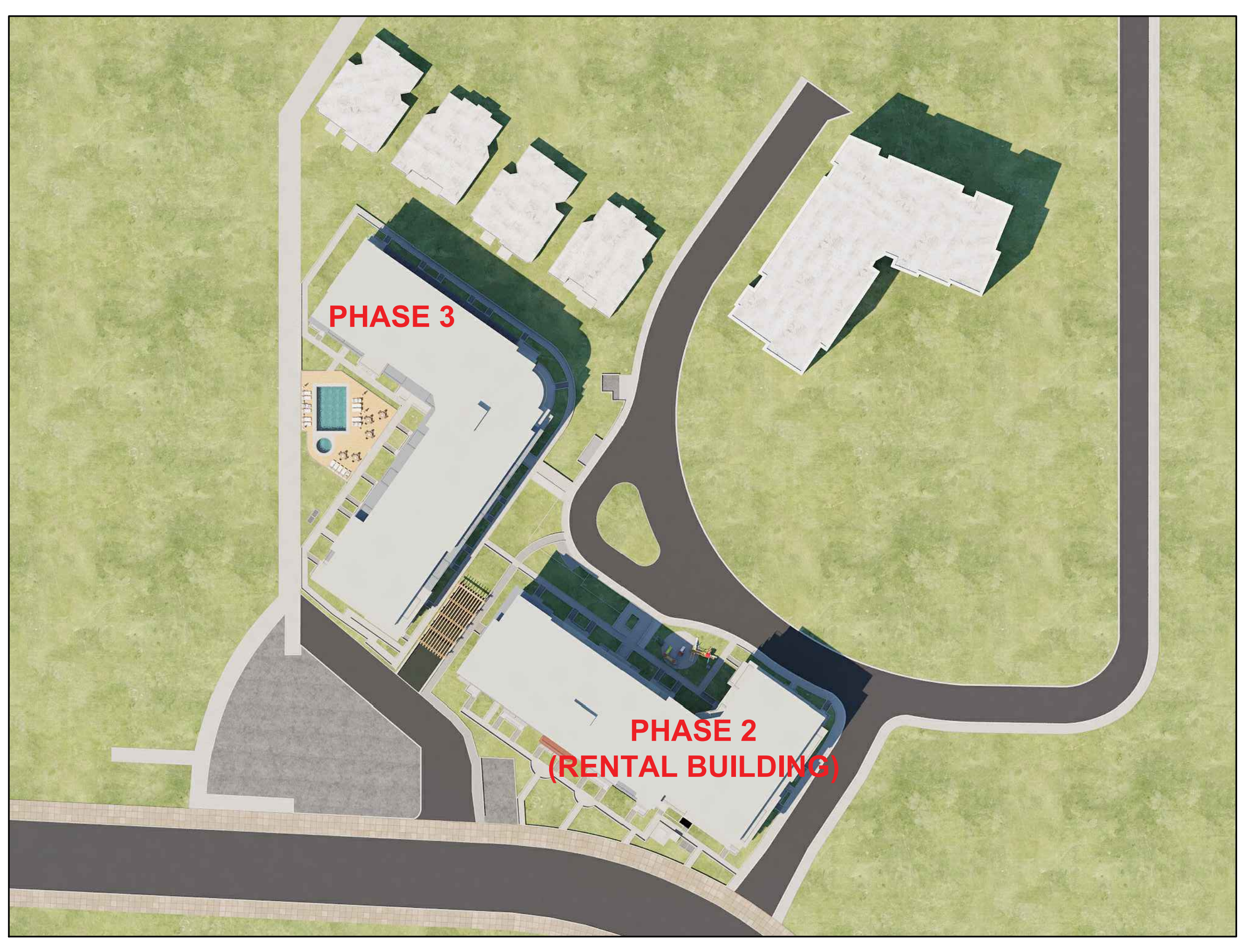
JUNE 22nd 2:00 PM