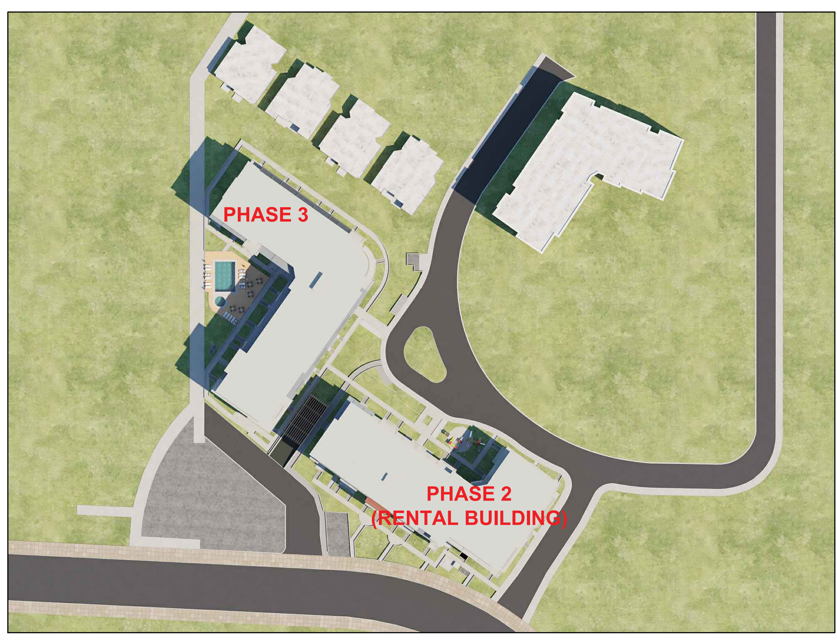
JUNE 22nd 10:00 AM